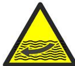
DANGER Strong Currents