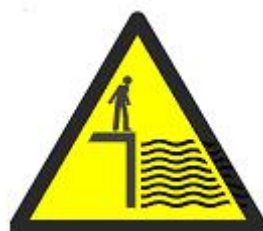
DANGER Deep Water