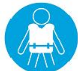
Lifejackets must be worn

More signs can be viewed at http://www.rospa.com/waterandleisuresafety/info/signs.pdf .